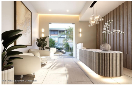
M.S. Vallarta Nayarit Compostela