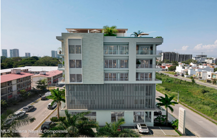
M.S. Vallarta Nayarit Compostela