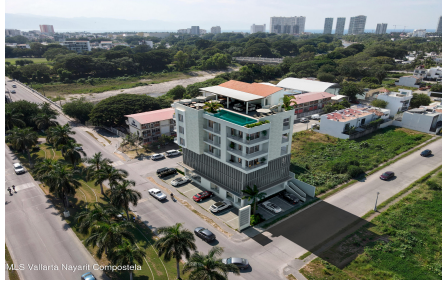
M.S. Vallarta Nayarit Compostela