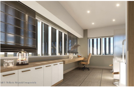
M.S. Vallarta Nayarit Compostela