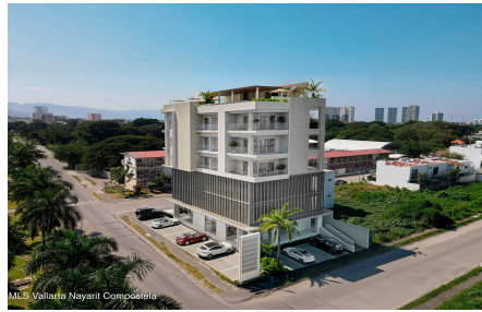
M.S. Vallarta Nayarit Compostela