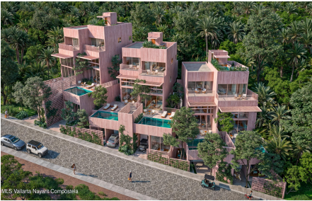
MLS Vallarta Nayari Compostela