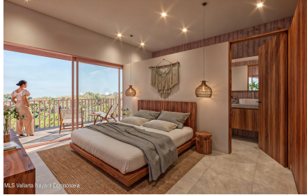
MLS Vallarta Nayari Compostela