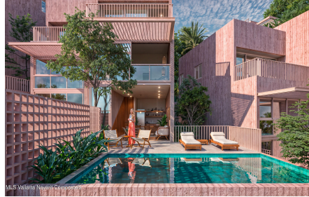
MLS Vallarta Nayari Compostela