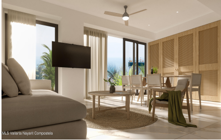
M/S Villaria Niyati Composita