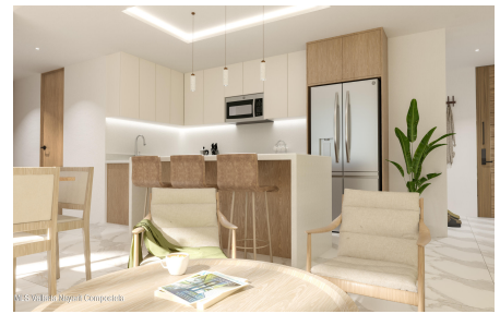
M/S Villaria Niyati Composita