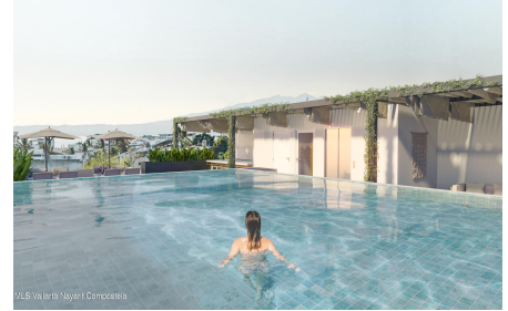
M/S Villaria Niyati Composita