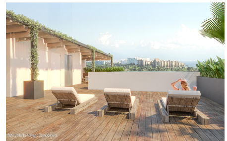
M/S Villaria Niyati Composita