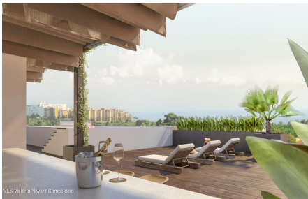
M/S Villaria Niyati Composita