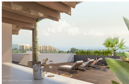
M/S Villaria Niyati Composita