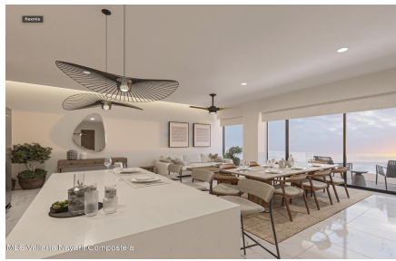
M/S Villaria Niyati Composita