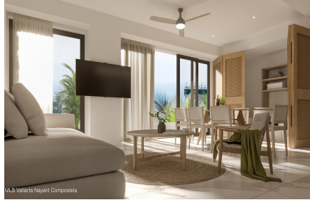
M/S Villaria Niyati Composita