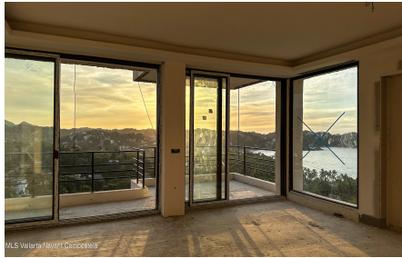
MLS Vallarta Nayant Compostela