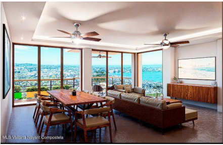
MLS Vallarta Nayant Compostela