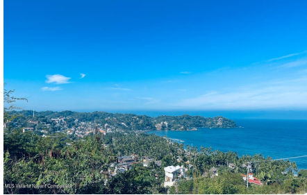
MLS Vallarta Nayant Compostela