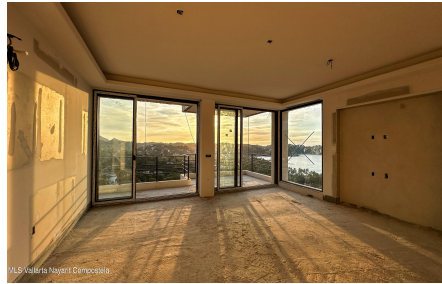
MLS Vallarta Nayant Compostela