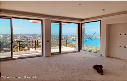
MLS Vallarta Nayant Compostela