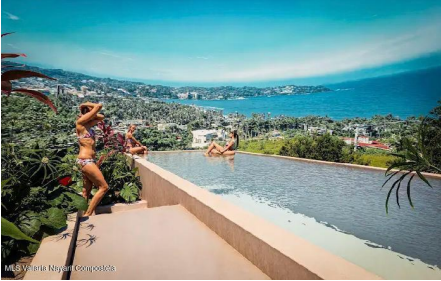
MLS Vallarta Nayant Compostela