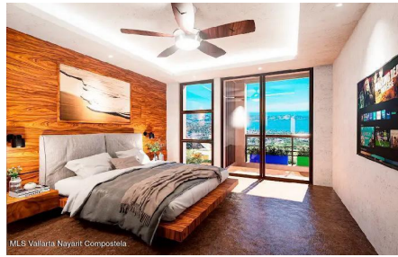
MLS Vallarta Nayant Compostela