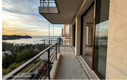
MLS Vallarta Nayant Compostela