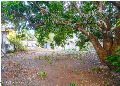
MI S Vallarta Nayarit Compostela