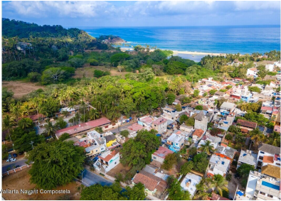
MI S Vallarta Nayarit Compostela