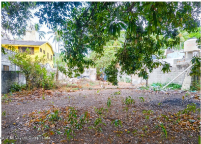
MI S Vallarta Nayarit Compostela