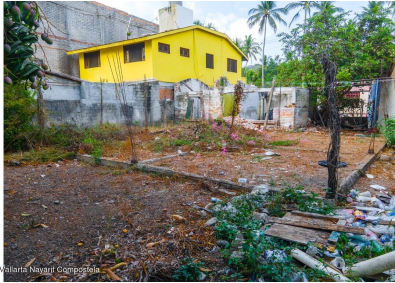
MI S Vallarta Nayarit Compostela