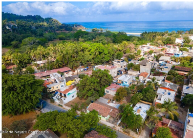
MI S Vallarta Nayarit Compostela