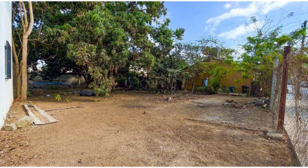
MI S Vallarta Nayarit Compostela