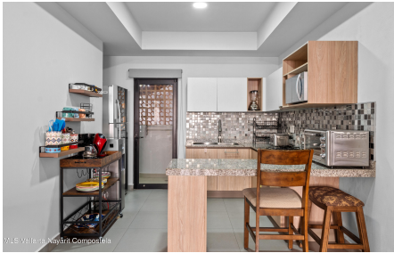
M.S. Vallarta Nayarit Compostela