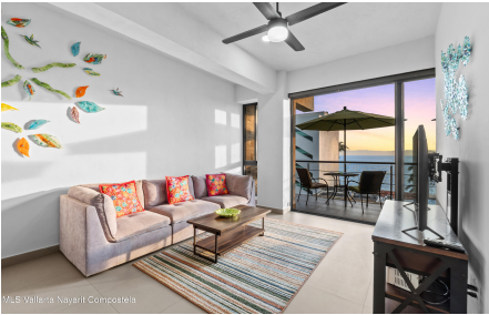
M.S. Vallarta Nayarit Compostela