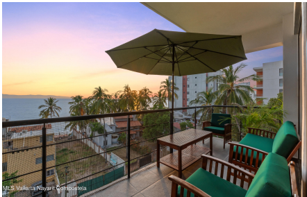
M.S. Vallarta Nayarit Compostela