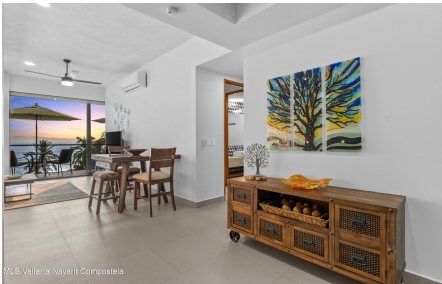
M.S. Vallarta Nayarit Compostela