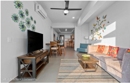
M.S. Vallarta Nayarit Compostela