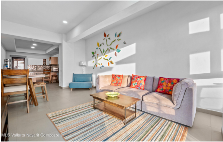
M.S. Vallarta Nayarit Compostela