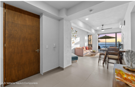
M.S. Vallarta Nayarit Compostela