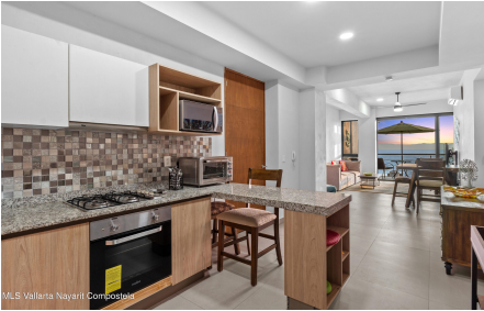
M.S. Vallarta Nayarit Compostela