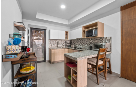
M.S. Vallarta Nayarit Compostela