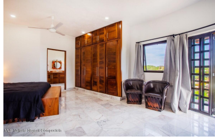
M.S. Vallaria Nayari Compostela