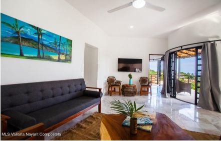
M.S. Vallaria Nayari Compostela