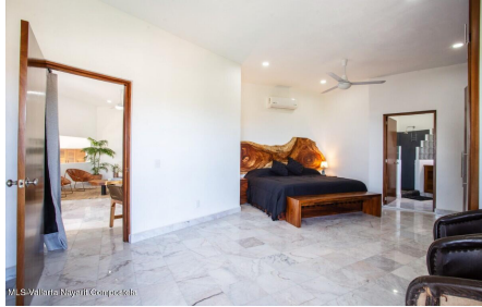
M.S. Vallaria Nayari Compostela