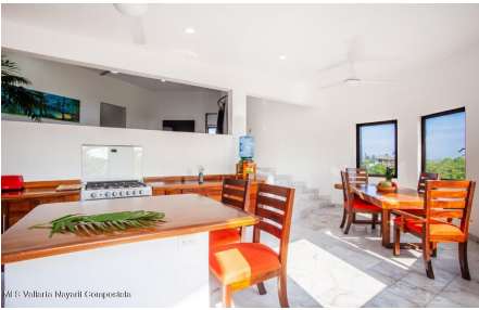
M.S. Vallaria Nayari Compostela