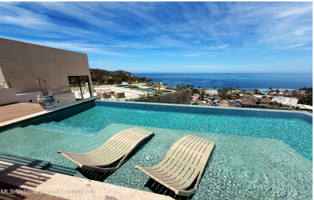
MLS Vallarta Nayari Compostela