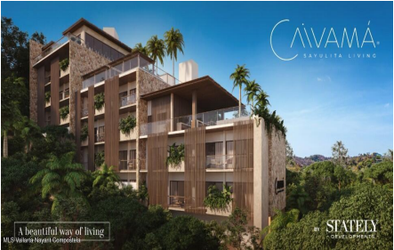
A beautiful way of living