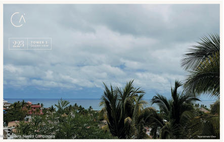
MLS Vallarta Nayari Compostela