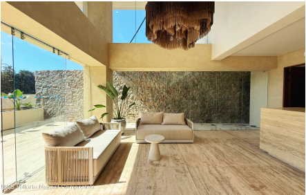
MLS Vallarta Nayari Compostela