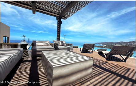
MLS Vallarta Nayari Compostela