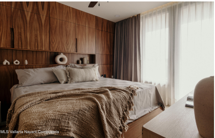
MLS Vallarta Nayari Compostela