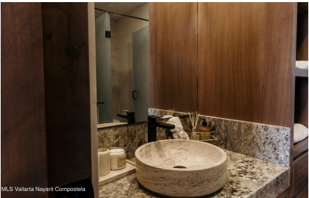
MLS Vallarta Nayari Compostela