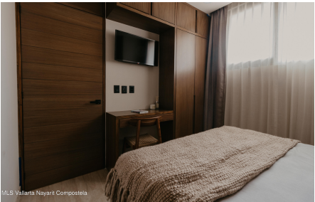
MLS Vallarta Nayari Compostela