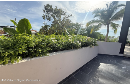
MLS Vallarta Nayarit Compostela