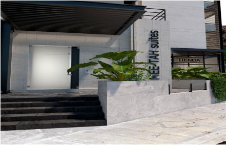
MLS Vallarta Nayarit Compostela