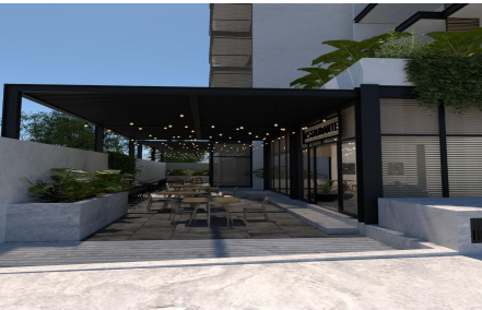
MLS Vallarta Nayarit Compostela