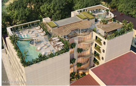
M&S Villarín Naya & Asociados