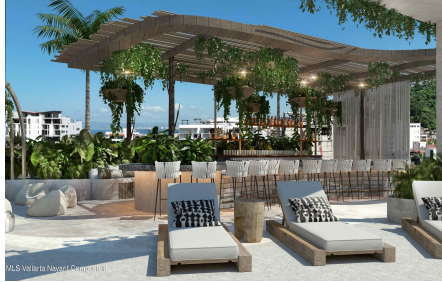
M&S Villarín Naya & Asociados