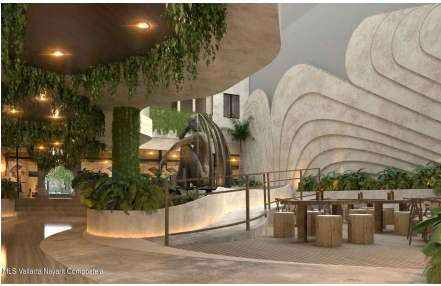
M&S Villarín Naya & Asociados