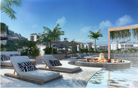
M&S Villarín Naya & Asociados