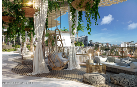
M&S Villarín Naya & Asociados