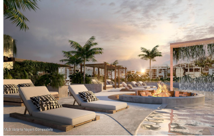
M&S Villarín Naya & Asociados