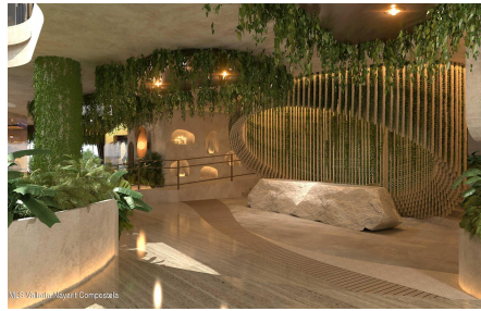
M&S Villarín Naya & Asociados