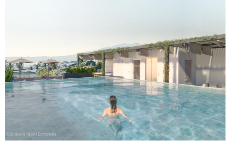
M/S Villaria Nayari Compostela