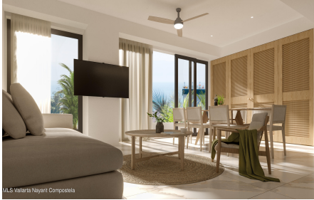
M/S Villaria Nayari Compostela