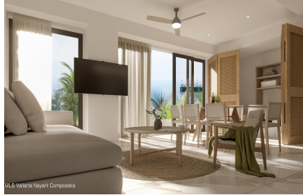
M/S Villaria Nayari Compostela