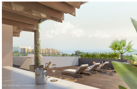
M/S Villaria Nayari Compostela