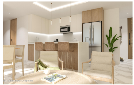
M/S Villaria Nayari Compostela