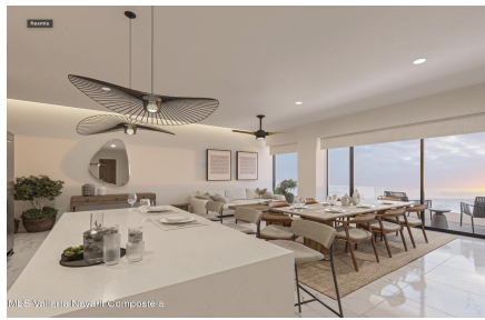
M/S Villaria Nayari Compostela