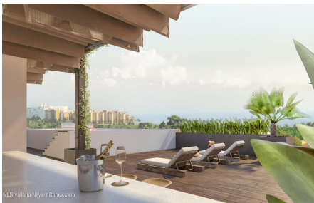
M/S Villaria Nayari Compostela