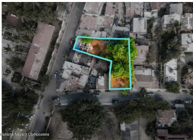
MI S Vallarta Nayarit Compostela

In the heart of San Pancho this unique lot sits across from the town park on Avenida Tercer Mundo, it also has access to Calle Africa, giving this property many options for development. It is located in the Mixed Use CRU - CUC zoning area of San Pancho, adding to the versatility of development potential. The correct size of the lot is 749 square meters, which is sufficient for a boutique hotel or small condo development with commercial frontage. The asking price is in pesos $18,000,000 MXN, so the USD price listed will vary, offers should be made in MXN pesos. Bare land sold As Is.