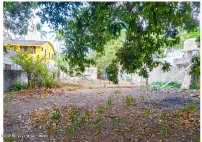
M/S Vallarta Nayarit Compostela