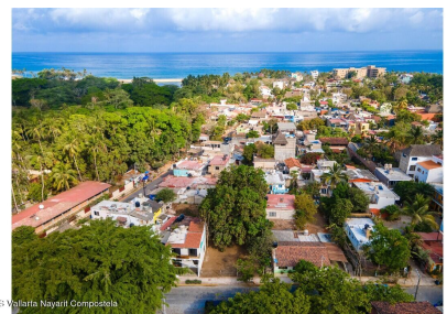
MI S Vallarta Nayarit Compostela