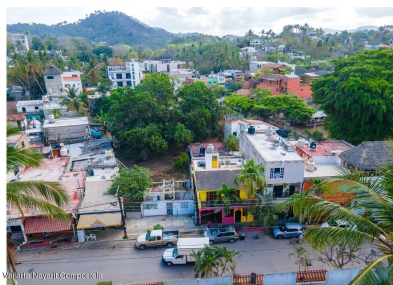
MI S Vallarta Nayarit Compostela