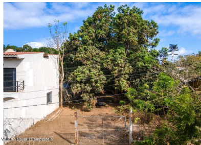
MI S Vallarta Nayarit Compostela