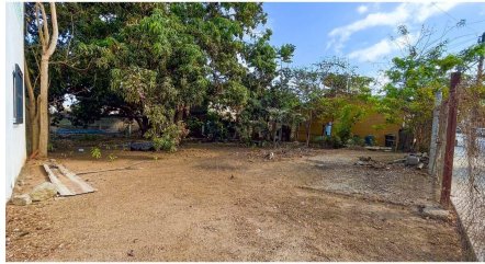
M/S Vallarta Nayarit Compostela