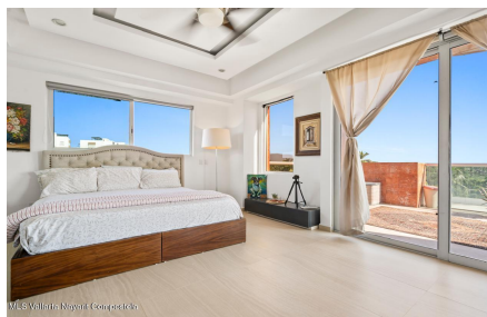
MES Vallarta Nayarit Compostela