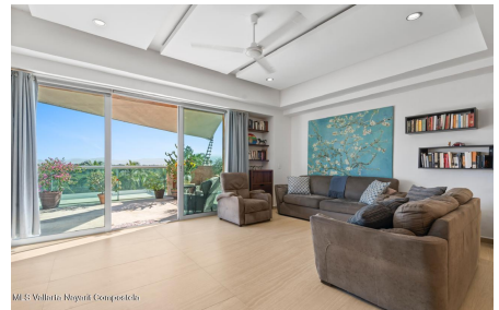
MES Vallarta Nayarit Compostela