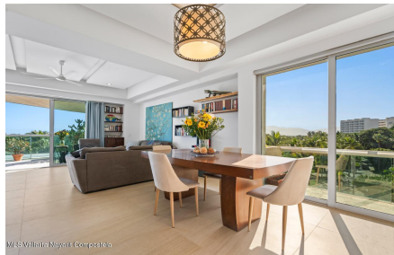
MES Vallarta Nayarit Compostela