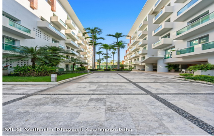
M/S Vallarta Nayarit Compro, S de RL