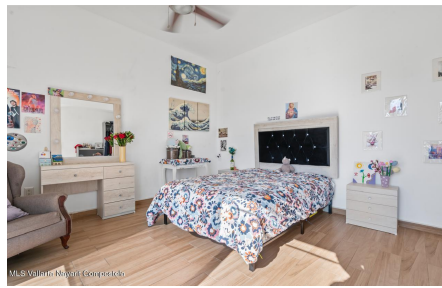
M/S Vallarta Nayarit Compro, S de RL