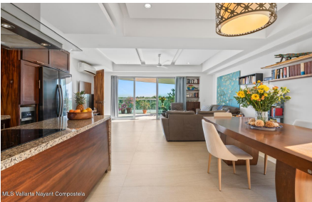
MES Vallarta Nayarit Compostela

Sophisticated 3-bedroom, 2-bathroom corner residence. This stunning home boasts a 50 m wraparound terrace with panoramic 180 views of the lush ecological reserve and the iconic Cocoterros Avenue biking and walking path. It features eight solar panels, delivering comfort and efficiency year-round. Step inside to a stylish island kitchen that flows seamlessly into expansive living and dining areas perfect for entertaining or unwinding. Residents enjoy premium amenities: co-working space, meeting room, gym, storage, landscaped gardens, BBQ areas, and a brand-new pool with shaded lounge areas. Just steps from the beach and