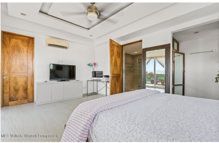
M/S Vallarta Nayarit Compro, S de RL