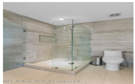
MES Vallarta Nayarit Compostela