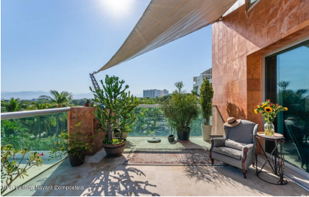
M/S Vallarta Nayarit Compro, S de RL