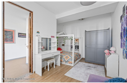
M/S Vallarta Nayarit Compro, S de RL