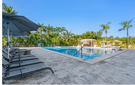
M/S Vallarta Nayarit Compro, S de RL