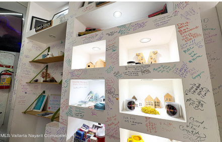
MLS Vallarta Nayari Compostela