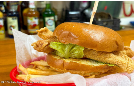
MLS Vallarta Nayari Compostela