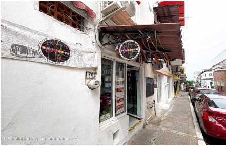
MLS Vallarta Nayari Compostela