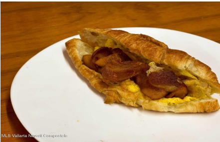
MLS Vallarta Nayari Compostela