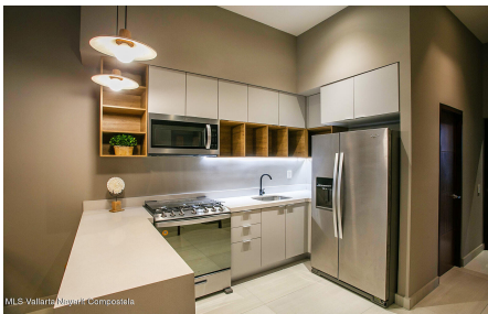
MLS Vallarta Nueva Compostela