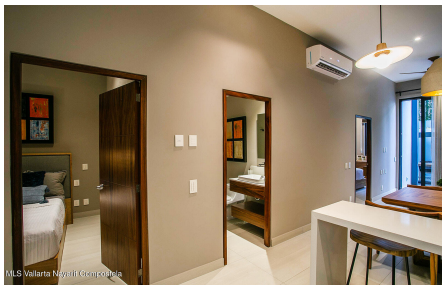
MLS Vallarta Nueva Compostela