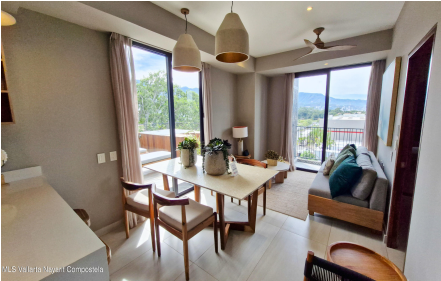
MLS Vallarta Nueva Compostela