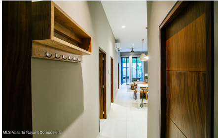
MLS Vallarta Nueva Compostela