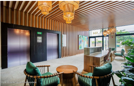
MLS Vallarta Maxima Compostela