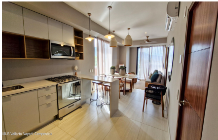
MLS Vallarta Nueva Compostela