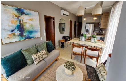
MLS Vallarta Nueva Compostela