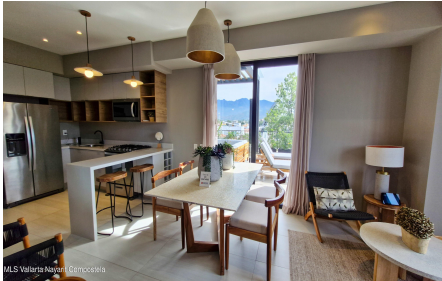
MLS Vallarta Nueva Compostela